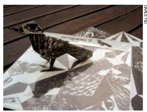
The finished product of the Collage series.

In traditional origami, you can fold as many different things as you like from a single piece of paper. But