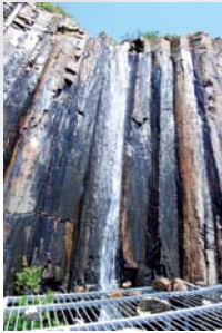
Nia Tam Kwai Ting

Y ou are walking along the road on the top of a dam. The azure sky and ocean are seemingly connected. You enjoy the sea breeze and take in the refreshing air. Then, suddenly, something attracts your gaze. It is a 30-metre tall wall made up of countless hexagonal volcanic columns.